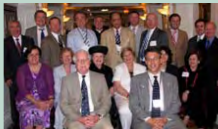
WCF V - Selection Committee

The World Congress of Families (WCF) was founded in 1995 by Dr. Allan C. Carlson (WCF International Secretary). There have been four Congresses to date – WCF I (Prague, 1997), WCF II (Geneva, 1999), WCF III (Mexico City, 2004) and WCF IV (Warsaw, 2007). The Warsaw Congress included more than 3,600 pro-family scholars, legislators, leaders and activists from 62 nations.