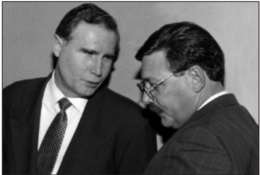
Peter Cutts Photography, Inc.

When the Department of Transportation proposed regulations that would have created a national ID card, home school families and other advocates of liberty moved to prevent the implementation of such an intrusive program. This battle resulted in the passage of a one-year moratorium on a national ID card, contained in the