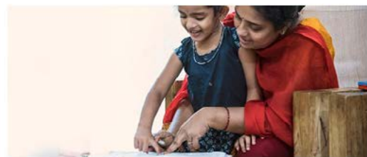
Example of Weekly Update Ad